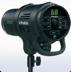
Profoto D1 500 Head